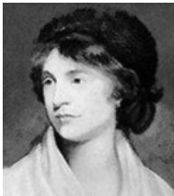
Mary Wollstonecraft Writer & Philosopher

Join with the League and other organizations on Wednesday, March 16, 5:00 to 6:30 p.m., Magnolia Room, Lake-Sumter Community College, Hwy 441, Leesburg , as we celebrate Women's History Month and recognize the following women in our community: