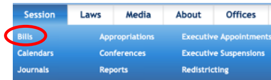
Exhibit 3 Search Example